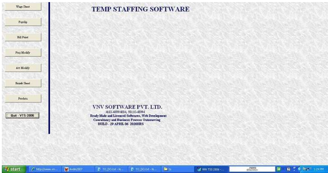
Screenshot of Employee master